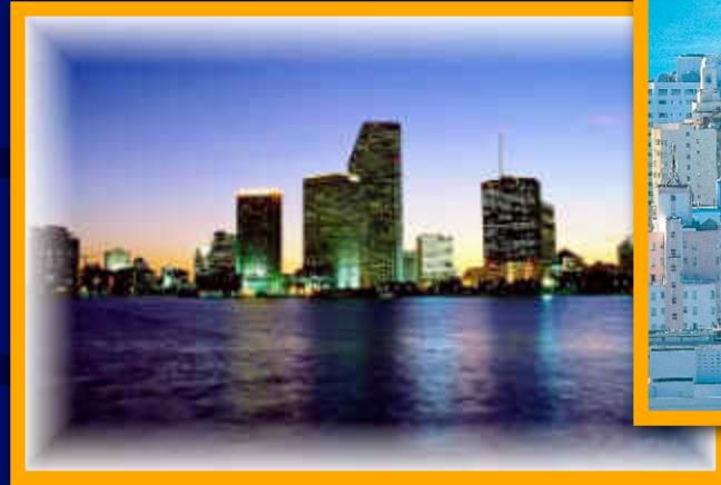
Miami, Florida – 2007